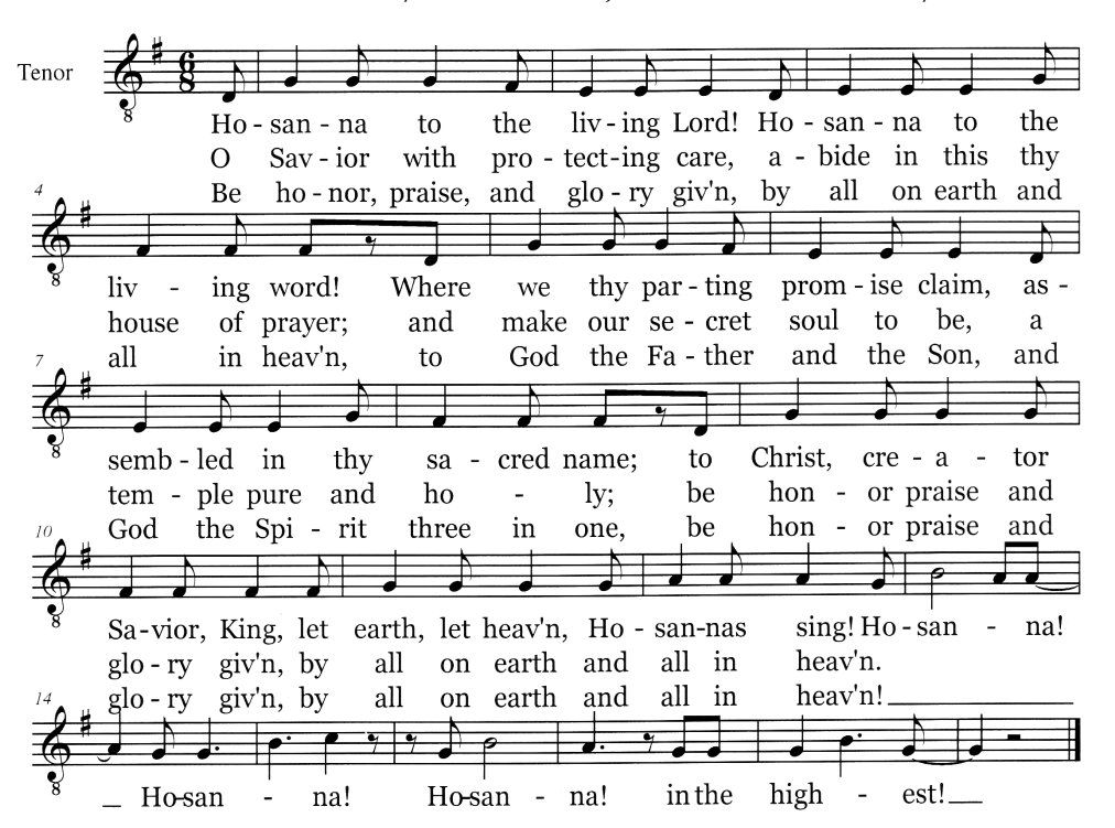
(Repeat final chorus)

Text: The Book of Common Prayer • Music: Benjamin Wilkinson • Used by Permission